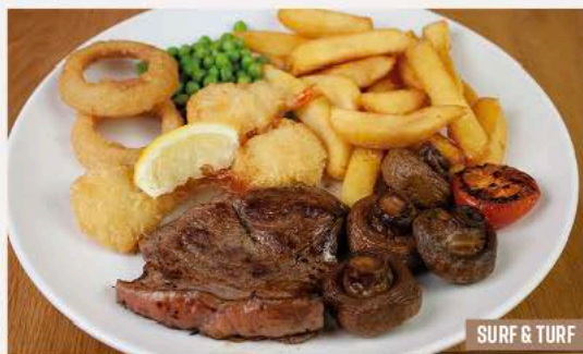
SURF & TURF

Steak Sauces are available. Please ask a member of staff for options