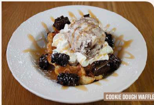
COOKIE DOUGH WAFFLE

Belgian Waffle topped with a scoop of Cookie Dough Ice Cream, Chocolate Brownie Chunks, Whipped Cream and Butterscotch Sauce.