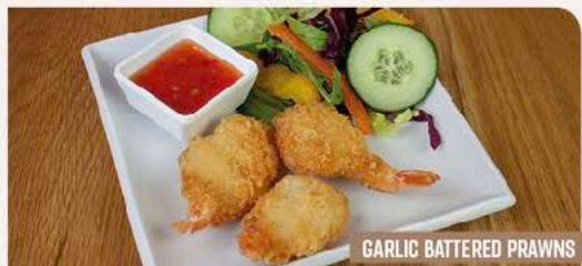
GARLIC BATTERED PRAWNS

Kiev style battered Prawns served with a Salad Garnish and Sweet Chilli Dip.