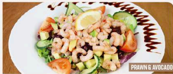
PRAWN & AVOCADO

Served with either Sweet Chilli Sauce or Traditional Marie Rose Sauce.