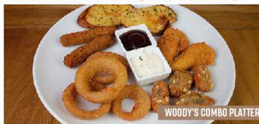
WOODY'S COMBO PLATTER

A delicious platter of Hot and Spicy Chicken Strips, Garlic Bread Slices, Onion Rings, Mozzarella Sticks and Nacho Bites. Served with Garlic Mayonnaise and BBQ Dips.