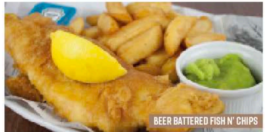
BEER BATTERED FISH N' CHIPS