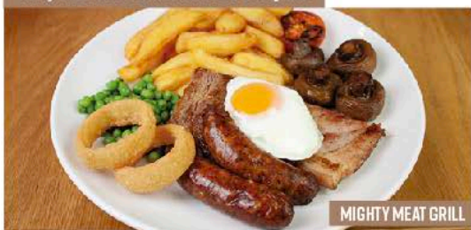
MIGHTY MEAT GRILL