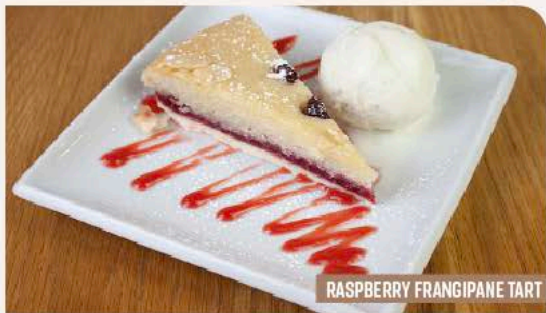
RASPBERRY FRANGIPANE TART