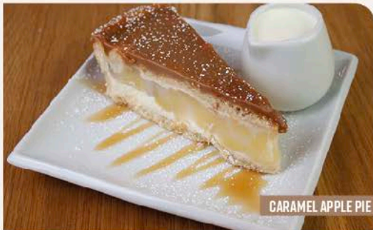
CARAMEL APPLE PIE

Delicious Apple Pie topped with a layer of Caramel. Served with Custard, Cream or Ice Cream.