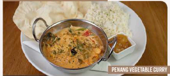
PENANG VEGETABLE CURRY